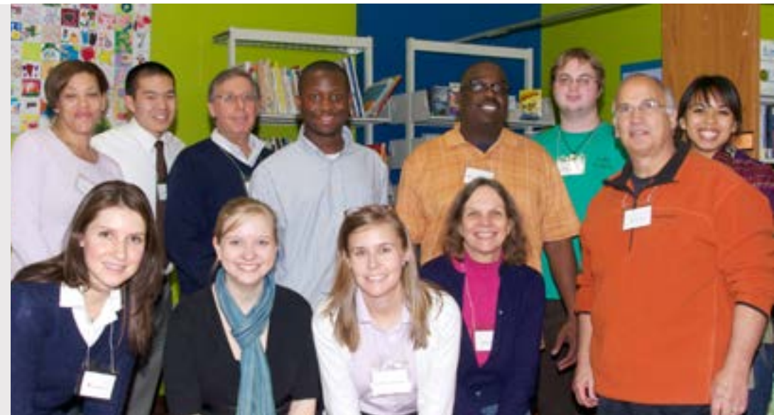
Staff and volunteers from the Mentor Y.O.U.th program.